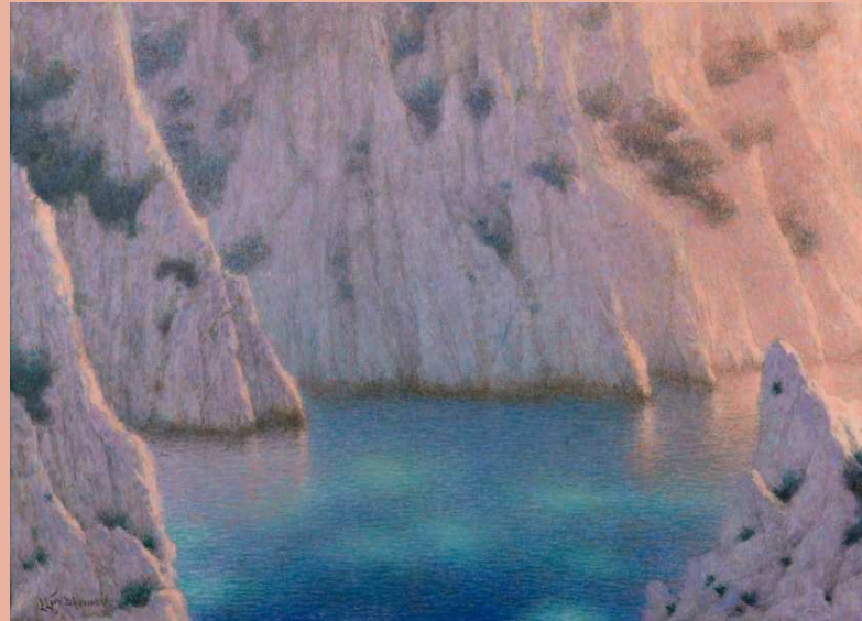
Calanque (six heures du soir) by Lucien Lévy-Dhurmer (1930-6)