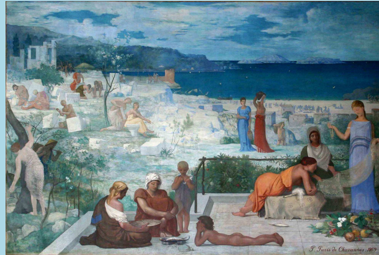
Marseille, colonie grecque (1869) by Pierre Puvis de Chavannes Musée des beaux-arts de Marseille